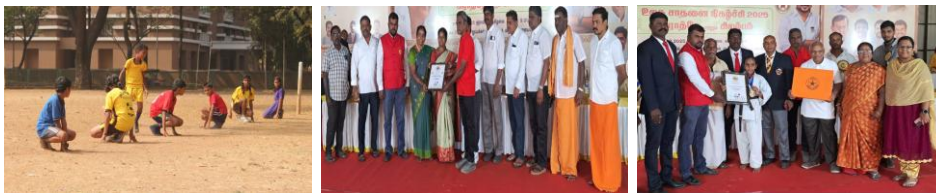
Caption: Public awareness activity promoting Indigenous games as low-emission, community-driven alternatives to resource-intensive sports under the Indigenous Games for Climate-Conscious Lifestyles Campaign , India, March 2025.

WIG Office: World Council of Indigenous Games, Sathy Rd, Housing Unit, Sri Laxmi Nagar, Ganapathy, Coimbatore-641006, Tamilnadu, India Tel. : +91- 6383635532 Web : www.indigenousgames.org E-mail : info@indigenousgames.org