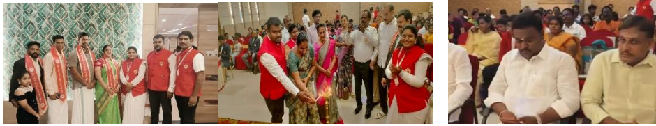
Caption: Members attending the Annual General Assembly of the World Council of Indigenous Games (WIG) , where sustainability, environmental responsibility, and climate-aligned planning were discussed, Tamil Nadu, India, December 2024.