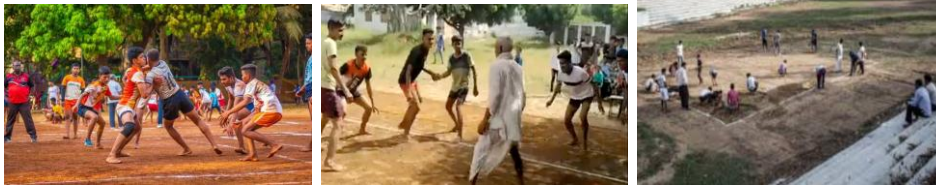
Caption: Community outreach session demonstrating traditional Indigenous games conducted in natural environments, emphasizing respect for ecosystems and nature-based practices, Rural Tamil Nadu, India, January 2025.